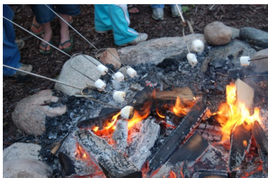
A campfire is often one of the high-lights for participants.

A retreat allows youth to get to know other young people from around the district at the same time that they can get to know their pastor