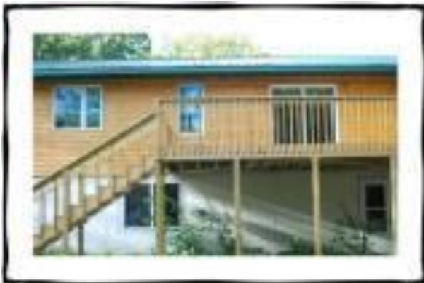
The Retreat House can house up to 20.

Fishing Boat. The cabin is equipped with a boat. If you would like to rent a boat motor the cost is $10 plus the cost of the fuel.