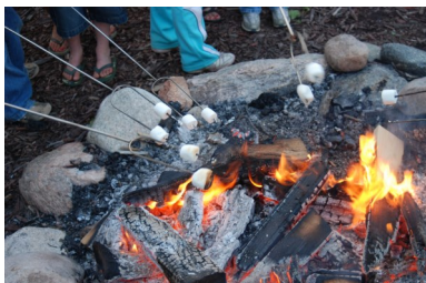
A campfire is often one of the highlights for participants.

A retreat allows youth to get to know other young people from around the district at the same time that they can get to know their pastor