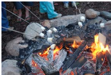
A campfire is often one of the highlights for participants.

A retreat allows youth to get to know other young people from around the district at the same time that they can get to know their pastor