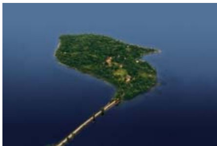
The Island is a peaceful and secluded location.