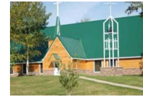
Newly remodeled chapel was originally built in 1953. It is now insulated and paneled with a new exterior as well

Plan to arrive by 7:00 on Friday evening. We'll close on Sunday with brunch.