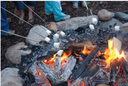
Making smores at the campfire is one of the many fun things the campers will do.

Take 30 or so kids who've been in school for 6 months; bring them out to camp for a weekend in the middle of February; throw in some of our best and brightest staff members; throw in a foot or two of snow, 18 inches of ice, and some great facilities; mix in a hayride, broomball, Thumper pond, skiing and hiking, a few campfires, hot chocolate, a great Bible Study, moving devotions and worship, and you have Trailblazer Winter Adventure. This year's Adventure is scheduled to begin Friday evening February 10th and will close out Sunday noon on the 12th. The cost is $89. Some camper-ships may be available. A bus will be coming up from the St. Cloud Area. Other buses can be arranged.