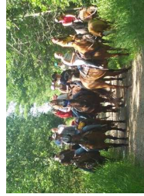
Lutheran Island Camp Horseback programs will bring well over 100 youth to camp in the next year. Many of these young people would go to secular horseback camps if it weren't for your sponsorship of a horse. For some, this is a wonderful opportunity to learn about God and His creation and His Son, Jesus.

Over 10 years ago the board and staff of Lutheran Island Camp saw the opportunity that providing a horseback riding program could bring. Within a few short years the HOP had grown to 6-7 weeks each year. The program was held in Perham, about 25 miles from the camp. In 2006 the program was moved to Leader, Minnesota where we rented the horses. In 2008, HOP will be coming back to the Henning area and we will be purchasing our own horses, saddles, and other equipment. In order for this excellent evangelism tool to work, we will need assistance from individuals, families, congregations, and organizations. HOP provides wonderful opportunities for Christian witness.