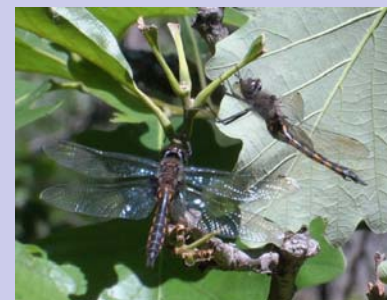
One of at least 20 varieties of dragonflies we'll see.