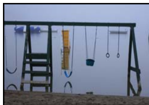
Using Reflection will be one of the topics that will be covered.

There will be no typical day as we'll need to modify our days according to light, weather, and other conditions. Campers will have plenty of opportunity to enjoy great camp activities and meals either as participants or as recorders using still and video cameras.