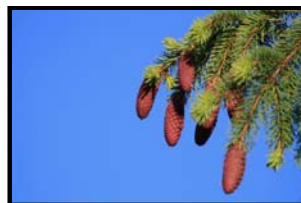
Contrasting colors can provide a combined beauty.