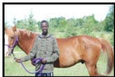
Capturing a moment in a child's life is priceless.

Christ Serve Ranch has 7-8 biomes and is home to nearly 100 species of birds, many flower and tree varieties, deer, turkeys, fox, and many other wild animals, insects, and flowers and grasses.