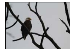
Eagles are a favorite to photograph.