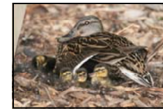
Fall is the perfect time to find ducks, geese, turkeys, deer, fox, and beautiful trees.