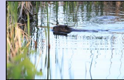
This beaver is one of many animals available to the patient photographer