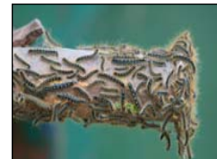
There is beauty even in destruction.

Please be aware that certain shots may take a great deal of time in one place.